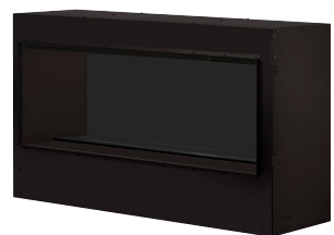
Optimyst® Pro 1000 Built-in box

Shown with spacer inserts for an organic flame.