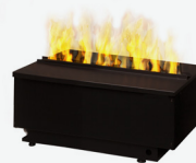
Three - Optimyst® 500 Cassette