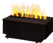
Two - Optimyst® 500 Cassette