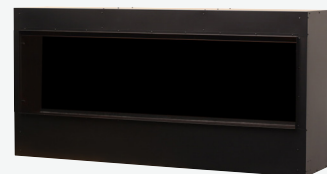
Optimyst® Pro 1500 Built-in Box